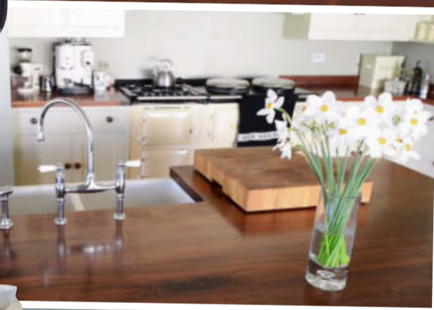
POLISHED OFF: The Everetts' luxurious hand-crafted kitchen at Anmer Hall, the new home of Royal cook Kate and William

Royal officials have been keen to stress that the couple paid for this one themselves.