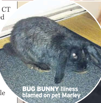
BUG BUNNY illness blamed on pet Marley