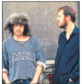
FORTUNE: The KLF