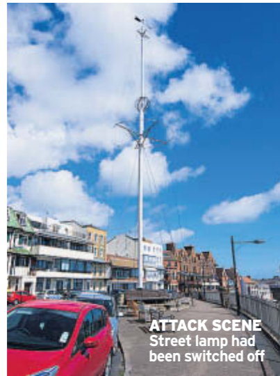
ATTACK SCENE Street lamp had been switched off

Migrants heading to Italy pay Libyan smugglers to organise their passage.