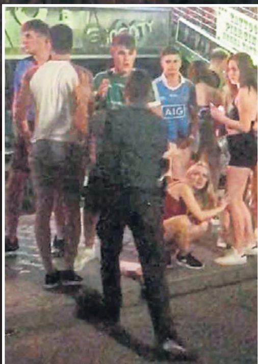
BUST-UP: Clubbers cower from the police