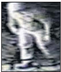
Suspect... on CCTV